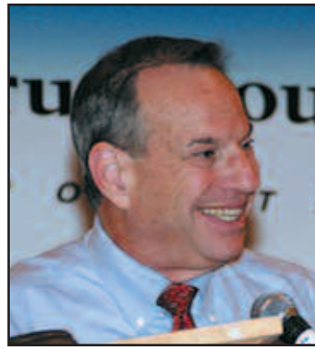
Bob Filner U.S. Representative (D-San Diego)